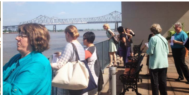
Taking a well-deserved break and enjoying riverside views right outside the hotel!

One of ARLIS/NA's new strategic directions is to serve as a community of practice for the exploration, cultivation, and sharing of innovative approaches and emerging technologies in libraries and art librarianship. At the Seattle conference, the board voted to form an Open Access Task Force to research and develop recommendations for the implementation of an ARLIS/NA open access publishing program that builds upon the Society's existing open access Learning Portal service. This group is chaired by