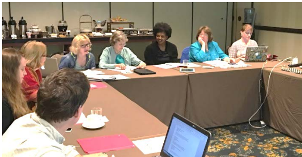
CPAC members worked on the program and budget over a two-day period at our conference hotel, the Hilton Riverside in New Orleans.

Earlier this month, I had the pleasure of joining our Conference Planning Committee (CPAC) in New Orleans to prepare for our 2017 conference. Thanks to all of you who submitted such engaging and timely proposals. Our CPAC has organized an incredible program for the conference that they will share with you soon. You can look forward to a very dynamic program of workshops and presentations, a special Leadership Institute, and inspiring guest speakers.